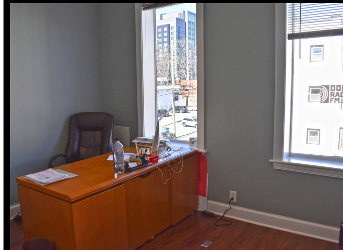
Large Executive Office or Open Work Space