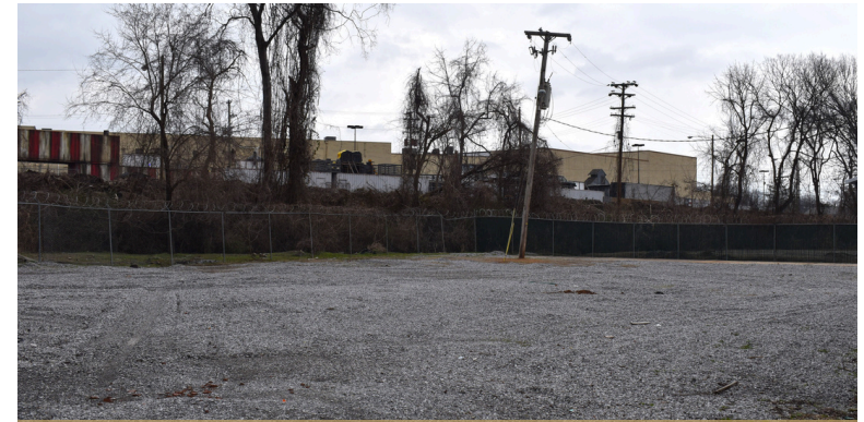
Ample Fenced Parking