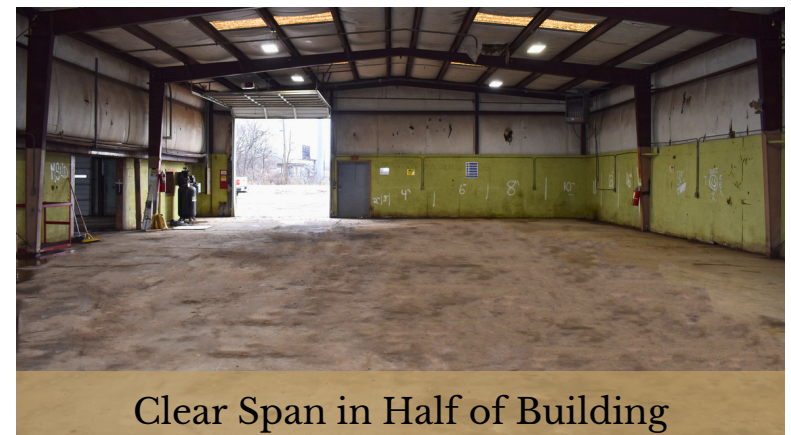
Clear Span in Half of Building

A portion of this property is located within the Flood Plain described by FEMA